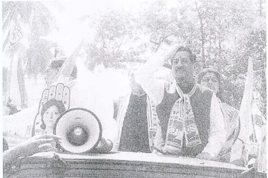
The matter was brought to the notice of former chief minister Prithviraj Chavan (above) and PCC chief Manikrao Thakre but was not reported to police.

A high profile former Congress minister told TOI that the funds were grossly inadequate. "Our information is that the AICC had released adequate funds, but the actual amount given to the candidates was meagre. Two of the ministers of state were given the responsibility to release the funds provided by the AICC," he said.