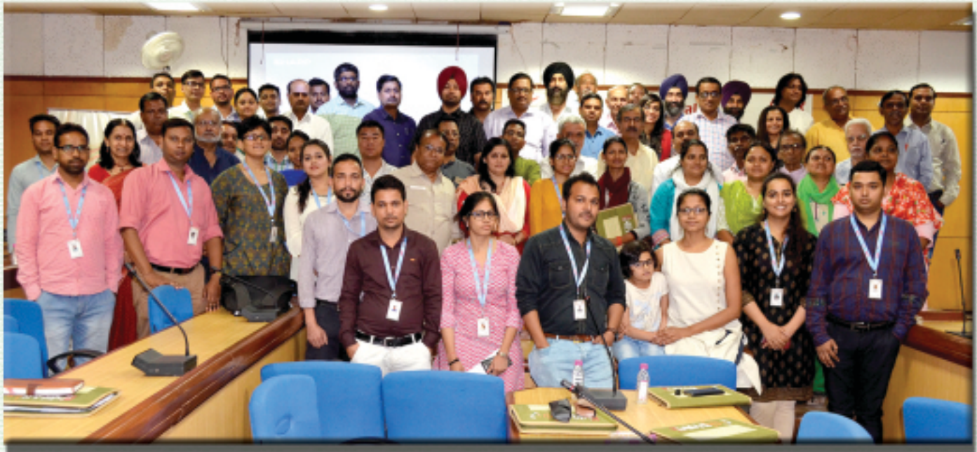
ADR team and State Coordinators and Partners at the Golden Jubilee Hall, Panjab University, Chandigarh, 29th April, 2017

"No office in the land is more important than that of being a citizen" -Felix Frankfurter